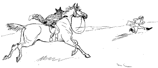
From The Fox jumps over the Parson's Gate (1883)

At the age of fifteen, Randolph started work in a Bank at nearby Whitchurch. Many of his later illustrations include buildings and scenery of that area. Even as young as fifteen, he had his first sketch and report published in the Illustrated London News : of a disastrous fire at the Queen Hotel in Chester. He took up hunting and this led him in later years to produce numerous drawings and sketches of hunting scenes, many of them humorous.