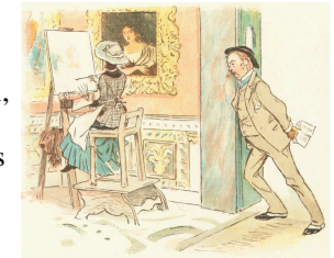
"... deeply interested in the copying of a picture" ( Graphic , Dec 1882).

Randolph continued to travel, partly for the sake of his health, and to make drawings of the people and places he visited; these drawings, accompanied by his humorous and witty captions and narrative, were published in the London Graphic .