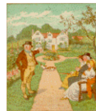
The House that Jack Built

In 1877 Edmund Evans, who was a colour printer and talented engraver, lost the services of Walter Crane as his children's book illustrator and asked Randolph to do illustrations for two books for Christmas. The results were The House that Jack Built and The Diverting History of John Gilpin , published in 1878. They were an immediate success; so much so that he produced two more each year until he died. The stories and rhymes were all of Randolph's choosing and in some cases were written or added to by him. By 1884, sales of Randolph's nursery rhymes had reached 867,000 copies (of twelve books) and he was internationally famous.